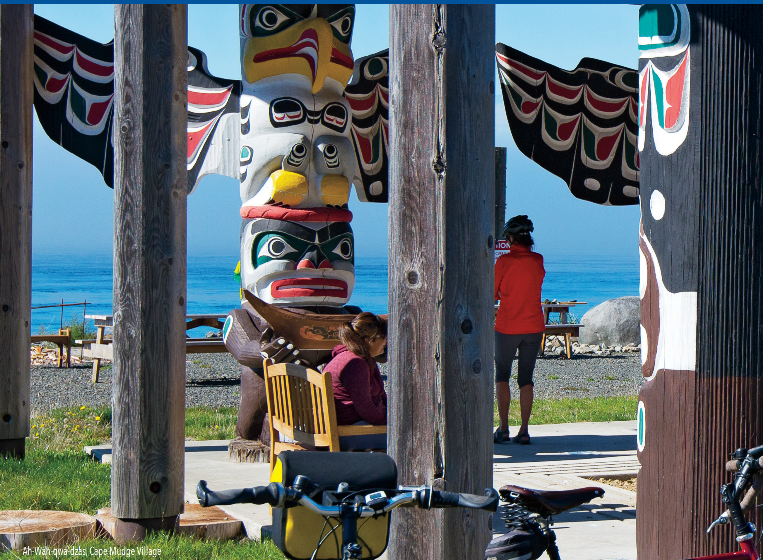
Ah-Wah-qwa-dzas, Cape Mudge Village